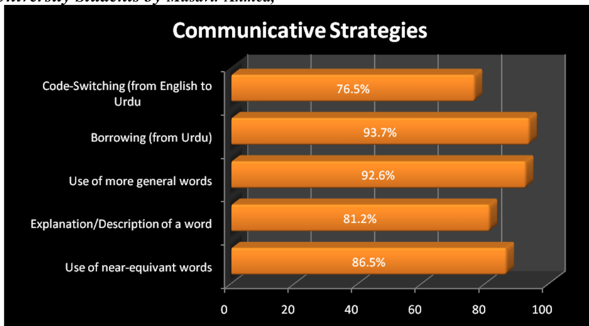
Graph 2: Significant Communicative Strategies employed by students of University of Kashmir while communicating on Facebook